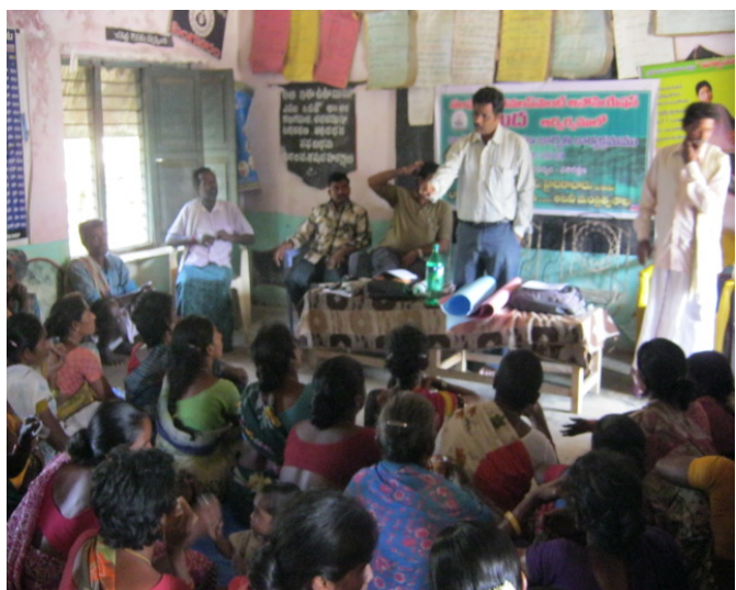
Photos related to Awareness camps and rally on the Environmental Awareness camps on Solid waste management and Bio-Diversity Conservation Activates.