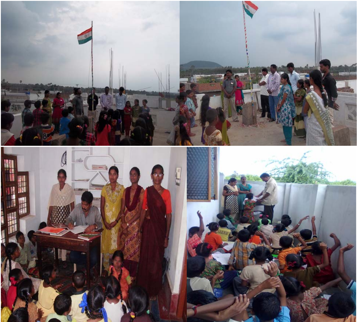
August 15 th Independence day event, Mandal Educational Office (MEO) visit and Mandal Resource person(MRP).

Residential Spatial Training Center(RSTC):- SAMIDA was Implementing the Education development and our of school children mainstreaming program with the support of Rajeev Vidhya Mission /SSA Visakhapatnam. In this activity we are adopting 52 out of school children in the Nakkapalli mandal with the support of the mandal educational officer. We are mainly focused on the fisher flock area. Their families are migrated to Konark (Odessa) and some other places of the Andhra Pradesh. Since form the 2004 to till we are mainstreamed 486 children in different schools and hostels in the Visakhapatnam District.