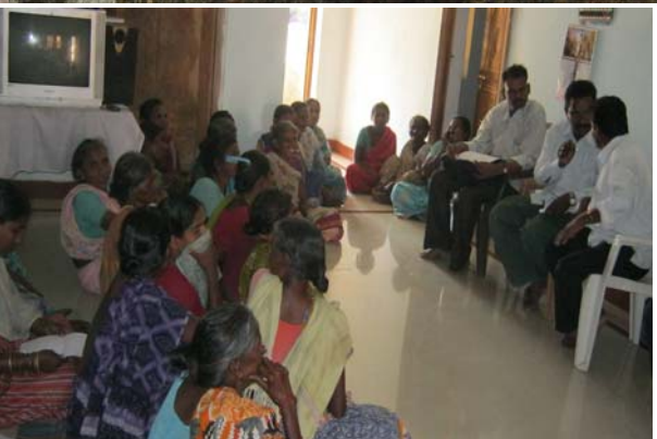
Village level ISL awareness camps and person Hygiene awareness wall posters in Nkkapalli mandal , Visakhapatnam Dist.